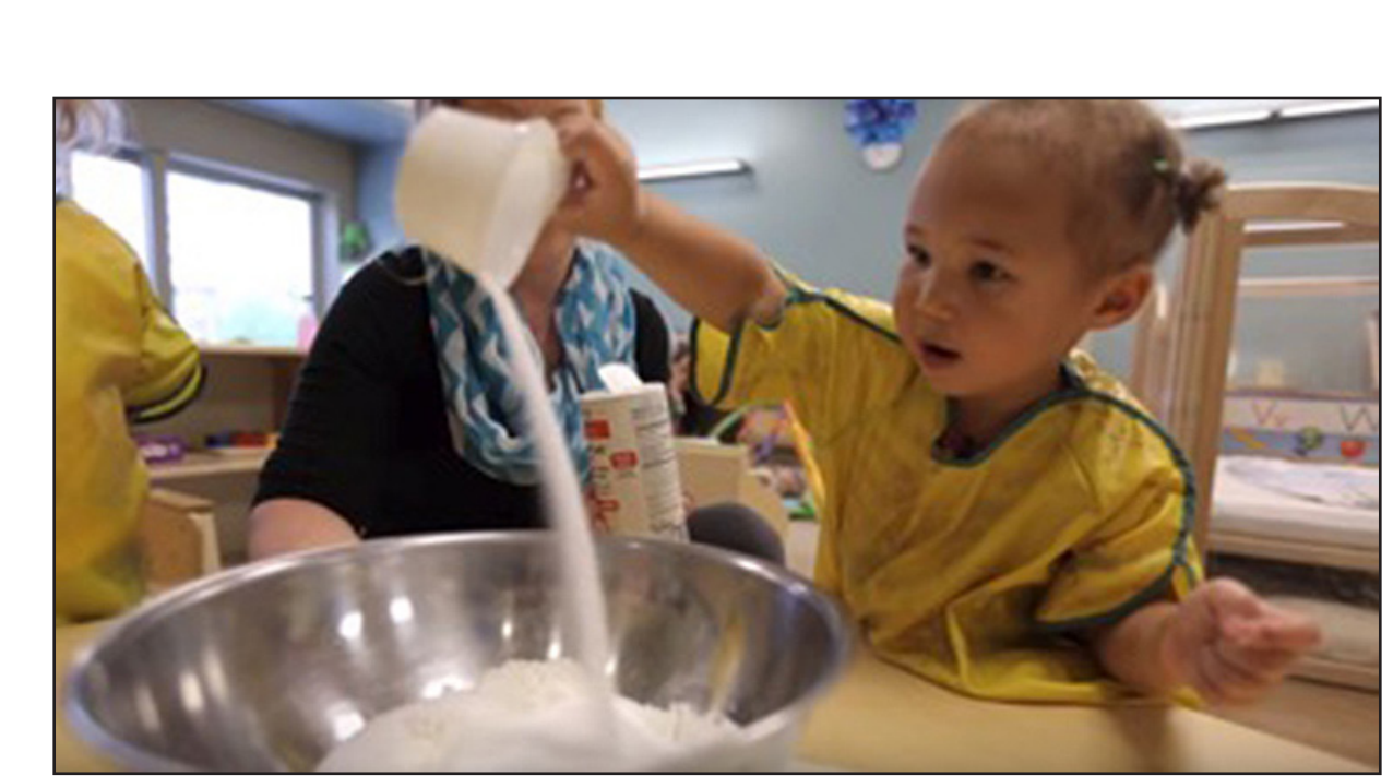
Figure 1. A child at Educare Central Maine. See <a href="https://www.youtube.com/watch?v=xkZXatJeZEo&list=PLHAnNxoFzX20bePE1JFZh6">https://www.youtube.com/watch?v=xkZXatJeZEo&list=PLHAnNxoFzX20bePE1JFZh6</a> <a href="mailto:1gmwj3-2PZ1&index=1&t=1m34s">1qmwj3-2PZ1&index=1&t=1m34s</a>

Some families, whose income is over the eligibility threshold, tuition their children to Educare Central Maine.