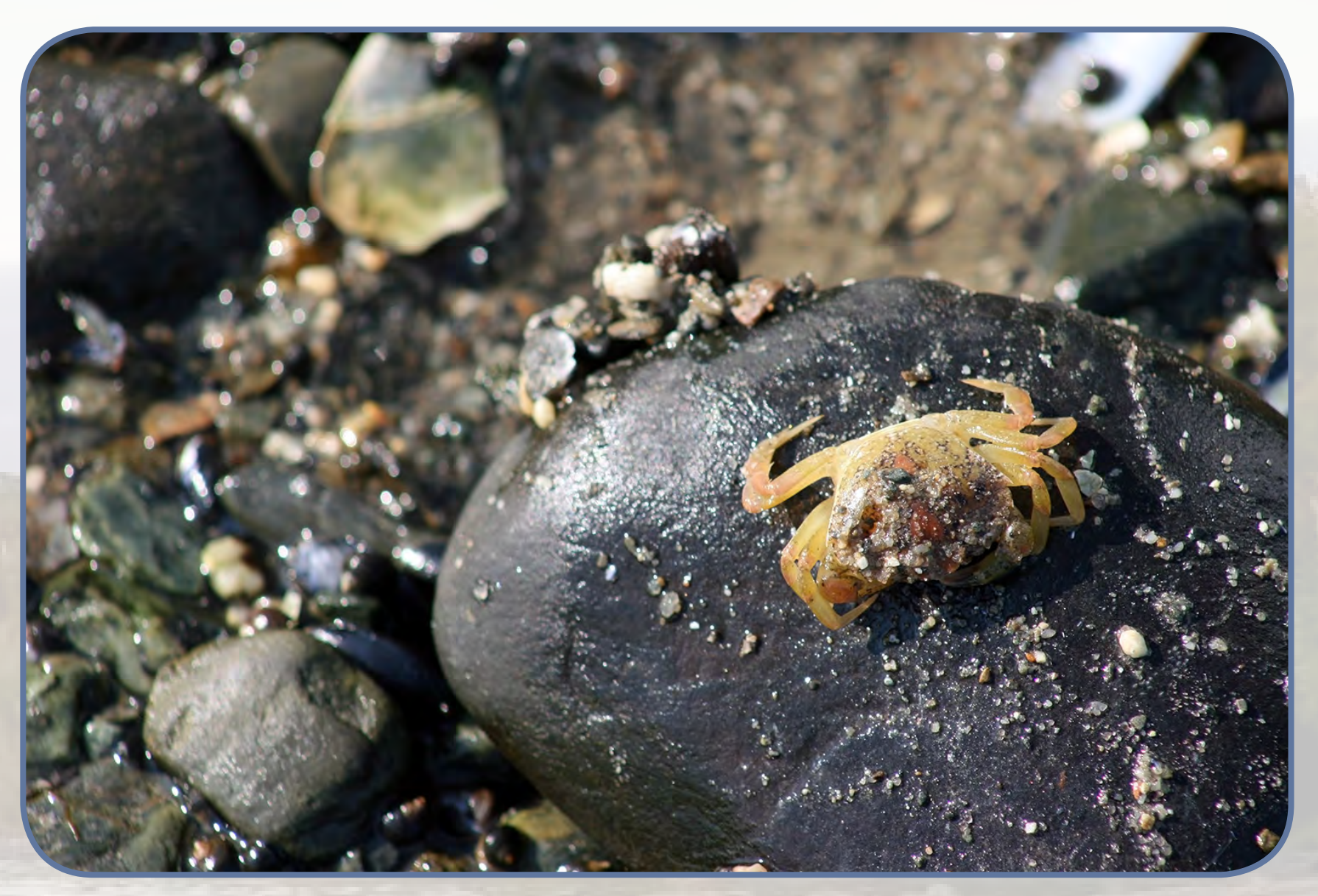
Close-up of an invasive green crab