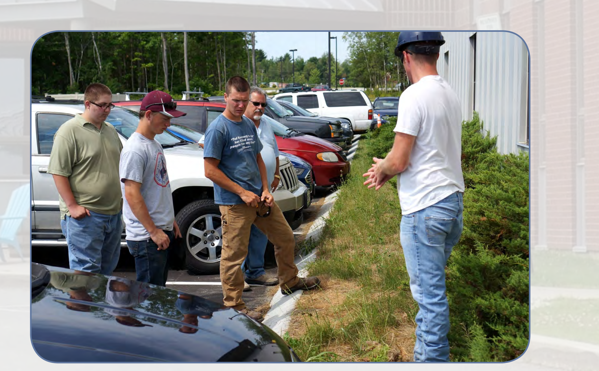
Students receiving instructions from supervisor