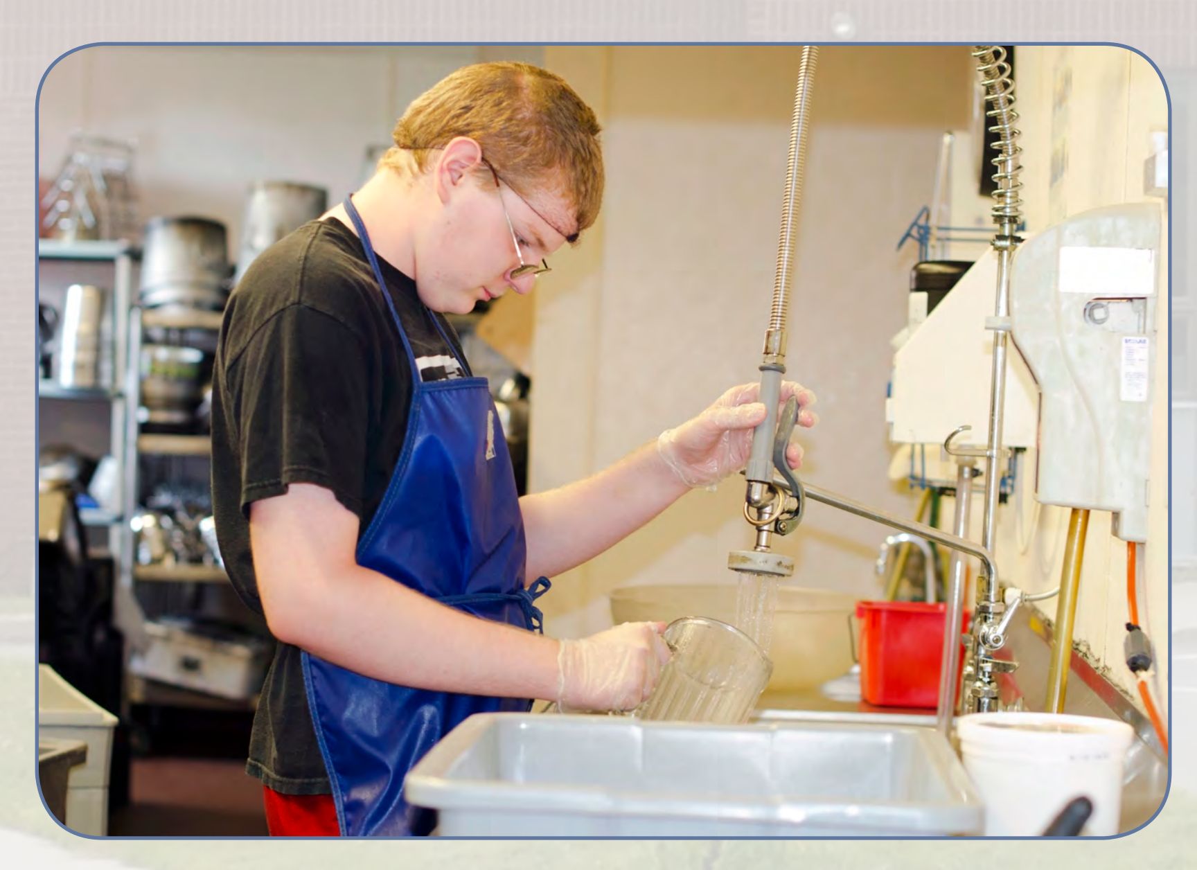
Student working in dining services