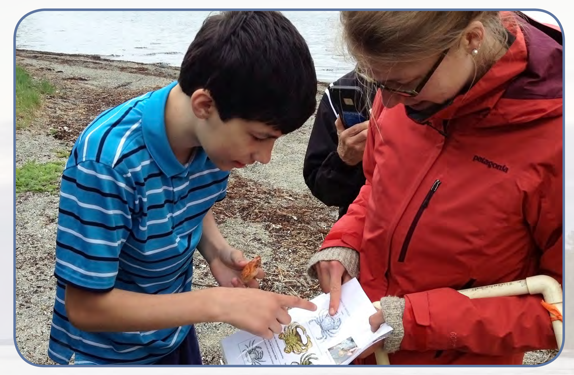
Student intern identifying a crab species