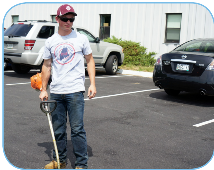
Student preparing for work with Grounds Crew