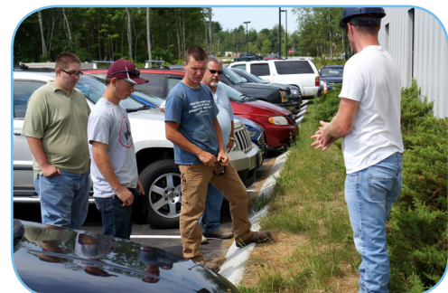
Two students listening to Grounds Crew Supervisor's instructions

Eastern Maine Community College Great College. Smart Choice.