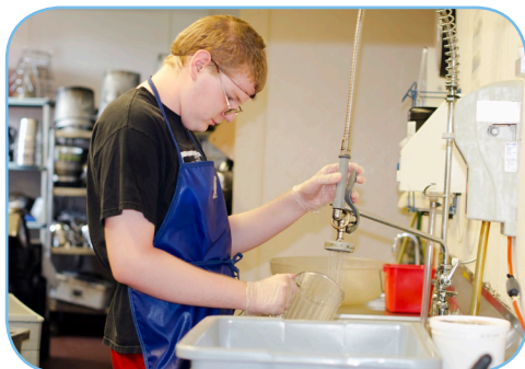
Student working in Flik Dining Services

Summer Work for ME received funding from the Maine Developmental Disabilities Council and leveraged funding from the Maine Department of Labor, Bureau of Rehabilitation Services to provide job coaching for the students at the work sites through Vocational Rehabilitation program situational assessment dollars. Community Rehabilitation Provider KFI led the development of the work sites at Eastern Maine Community College and the hiring and training of job coaches.