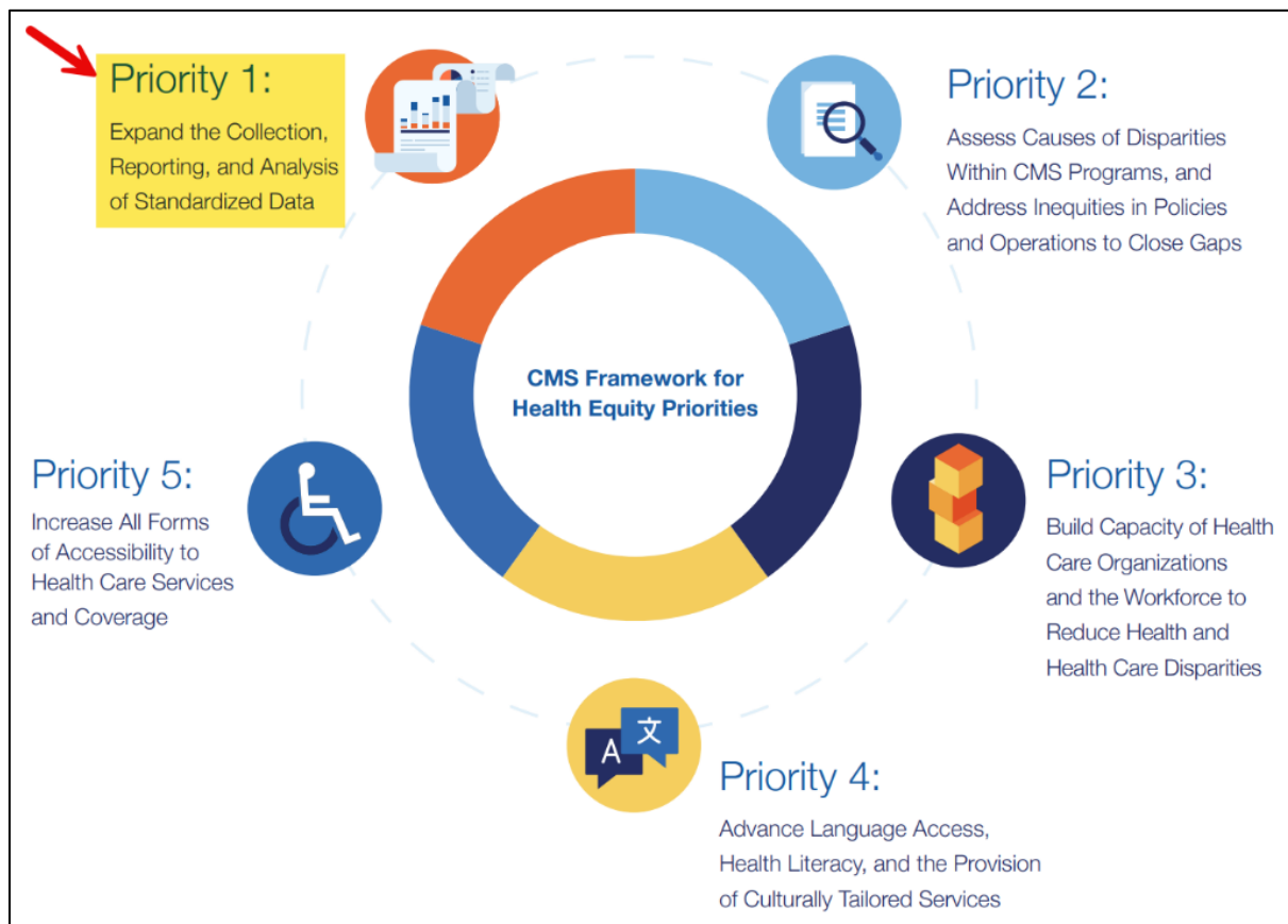
Figure 1. CMS Framework for Health Equity Priorities 2

To examine healthcare access and health outcomes across communities, health data must be able to be disaggregated and analyzed for each community within a society. This work is facilitated by collecting data as demographic elements, as is commonly done with race, ethnicity, gender, and age. To identify data practices concerning Maine's disability community, this scan focused on the following questions: